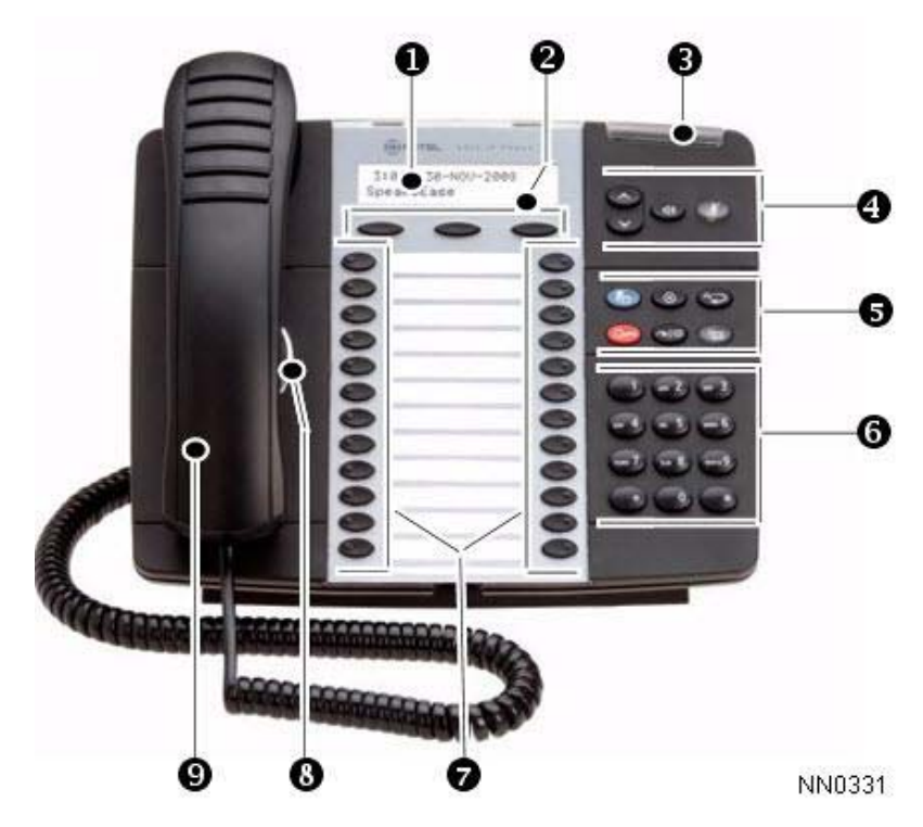
5324 IP Phone